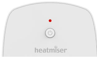
Flashes when not paired to neoHub